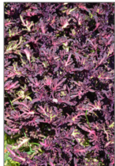
Merlin's Magic Coleus foliage