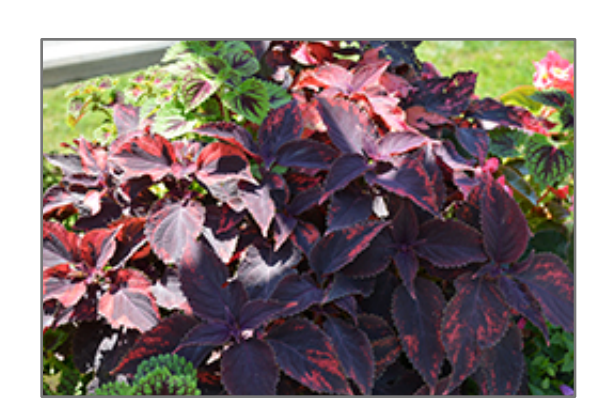
Religious Radish Coleus foliage

Religious Radish Coleus' attractive large serrated pointy leaves remain deep purple in colour with distinctive red edges throughout the year on a plant with an upright spreading habit of growth.