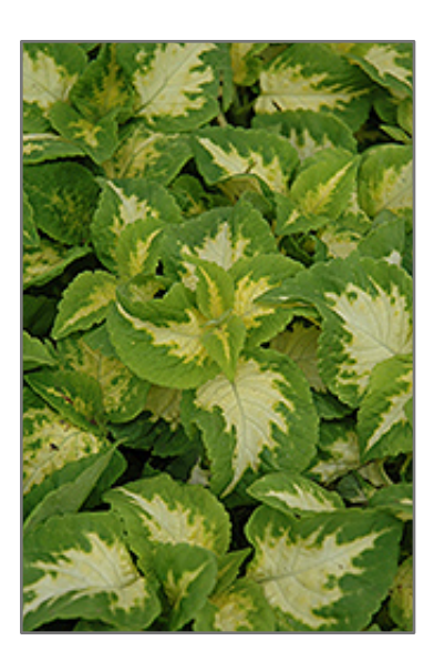
Wizard Jade Coleus foliage

Wizard Jade Coleus' attractive serrated pointy leaves remain forest green in colour with hints of creamy white throughout the year on a plant with an upright spreading habit of growth.