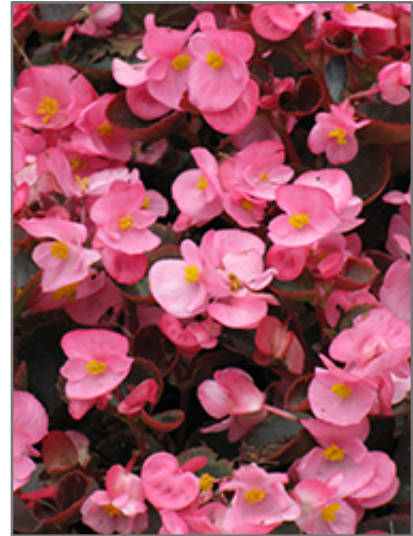
Bada Boom Pink Begonia flowers