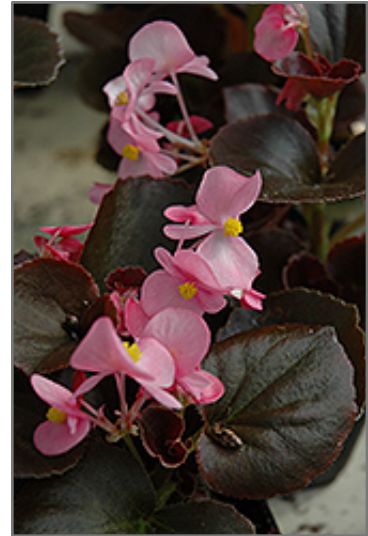
Cocktail Gin Begonia flowers