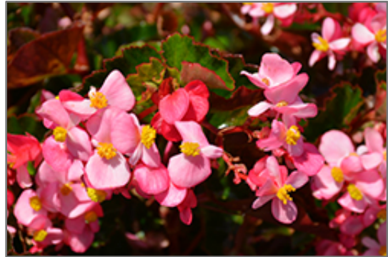
BabyWing Pink Begonia flowers

This is a high maintenance plant that will require regular care and upkeep, and usually looks its best without pruning, although it will tolerate pruning. Deer don't particularly care for this plant and will usually leave it alone in favor of tastier treats. Gardeners should be aware of the following characteristic(s) that may warrant special consideration;