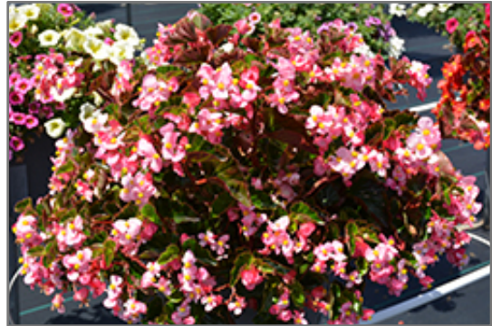
BabyWing Pink Begonia in bloom

BabyWing Pink Begonia is a fine choice for the garden, but it is also a good selection for planting in outdoor containers and hanging baskets. It is often used as a 'filler' in the 'spiller-thriller-filler' container combination, providing a mass of flowers and foliage against which the thriller plants stand out. Note that when growing plants in outdoor containers and baskets, they may require more frequent waterings than they would in the yard or garden.