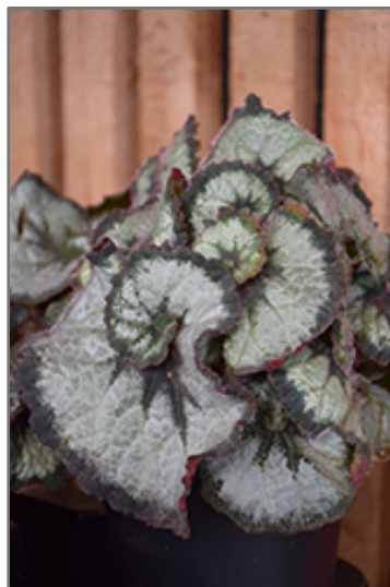
Escargot Begonia foliage