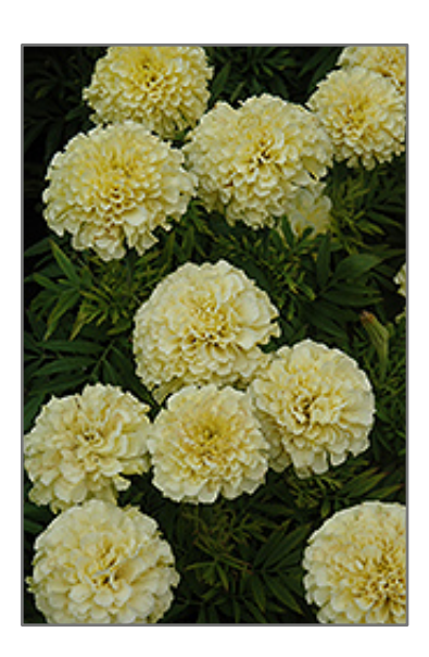
French Vanilla Marigold flowers

French Vanilla Marigold features bold creamy white ball-shaped flowers at the ends of the stems from early summer to mid fall. The flowers are excellent for cutting. Its fragrant ferny leaves remain dark green in colour throughout the season.