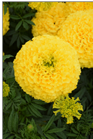
Marvel Yellow Marigold flowers

Marvel Yellow Marigold is recommended for the following landscape applications;