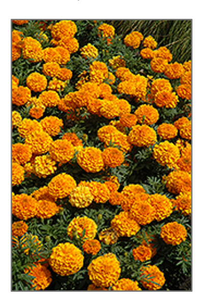
Taishan Orange Marigold flowers