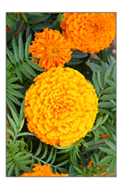
Taishan Orange Marigold flowers