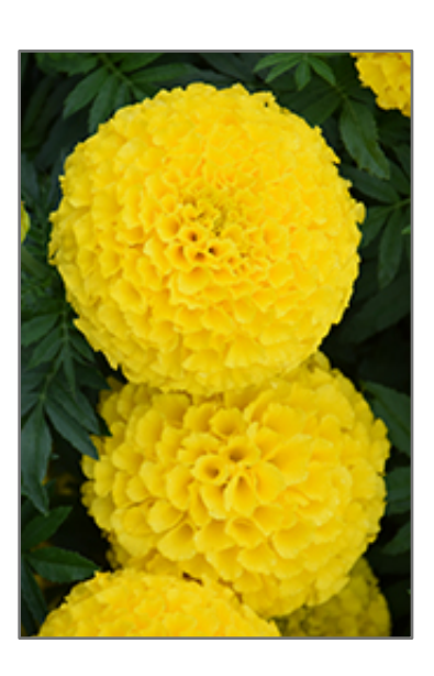
Taishan Yellow Marigold flowers