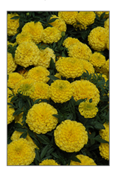
Taishan Yellow Marigold flowers