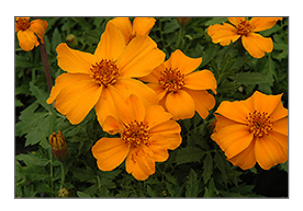
Disco Orange Marigold flowers