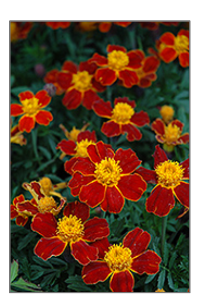
Disco Red Marigold flowers

Disco Red Marigold features bold dark red daisy flowers with yellow eyes and yellow edges at the ends of the stems from late spring to late summer. The flowers are excellent for cutting. Its fragrant ferny leaves remain dark green in colour throughout the season.