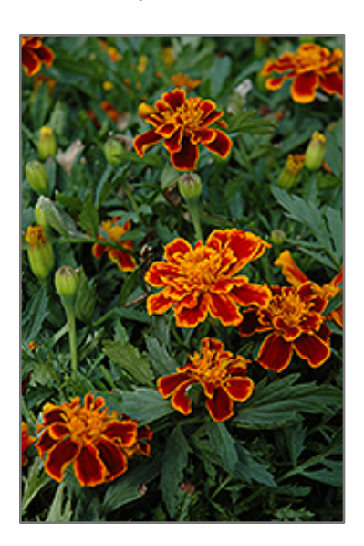
Durango Flame Marigold flowers