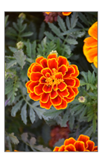
Durango Flame Marigold flowers