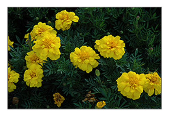
Durango Yellow Marigold flowers

Durango Yellow Marigold is recommended for the following landscape applications;