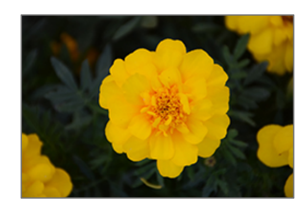
Durango Yellow Marigold flowers

This is a relatively low maintenance plant. Trim off the flower heads after they fade and die to encourage more blooms late into the season. Deer don't particularly care for this plant and will usually leave it alone in favor of tastier treats. It has no significant negative characteristics.