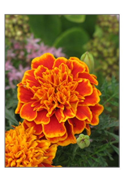
Janie Flame Marigold flowers

Janie Flame Marigold features bold gold pincushion flowers with brick red streaks at the ends of the stems from late spring to late summer. The flowers are excellent for cutting. Its fragrant ferny leaves remain dark green in colour throughout the season.