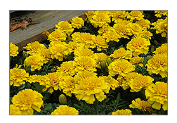
Janie Bright Yellow Marigold flowers