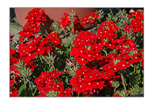
Aztec Red Velvet Verbena flowers

Hardiness Zone: (annual) Other Names: Vervain Group/Class: Aztec Series