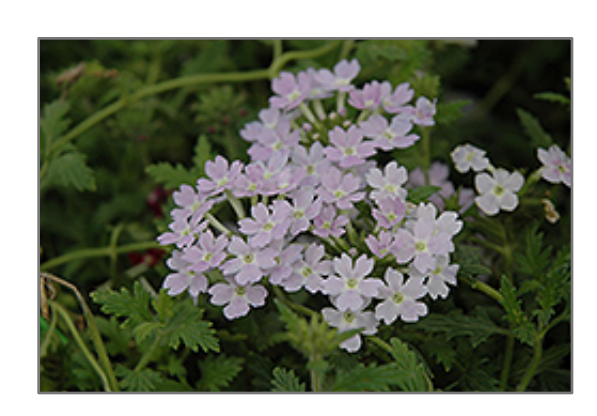
Aztec Magic Silver Verbena flowers

This excellent verbena series is early to flower and quite vigorous; cascading trails are smothered with flowers all summer long; a perfect addition to hanging baskets and containers