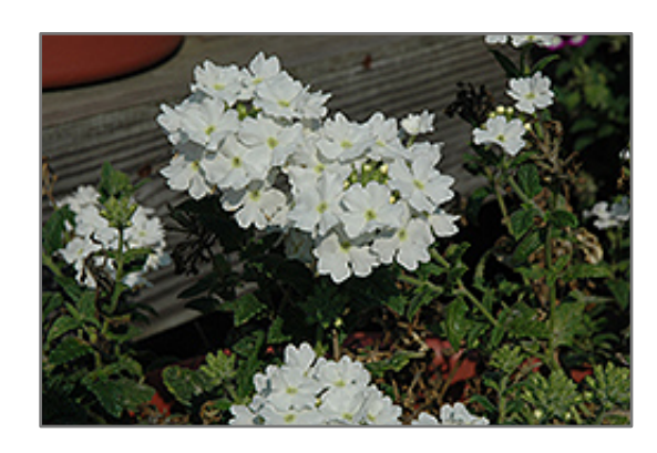
Aztec White Verbena flowers

Hardiness Zone: (annual) Other Names: Vervain Group/Class: Aztec Series