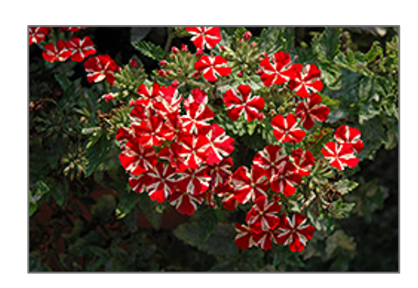
Estrella Voodoo Star Verbena flowers