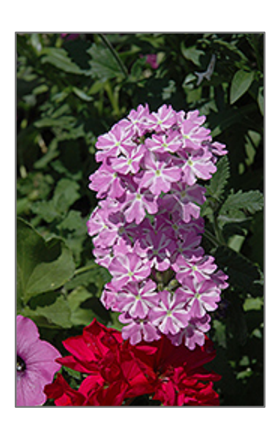
Lanai Purple Rain Mix Verbena flowers