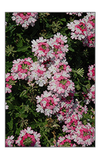
Lanai Twister Pink Verbena flowers

A vigorous, versatile series with excellent powdery mildew resistance; its trailing habit is perfect for hanging baskets, mixed containers, or beds