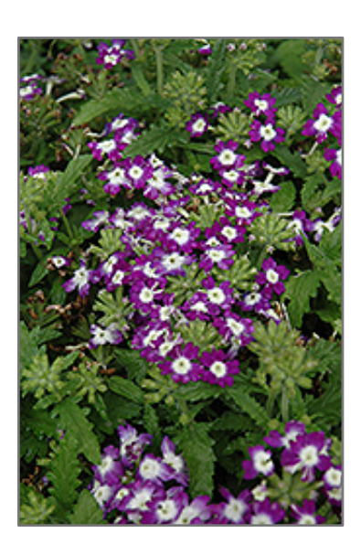
Obsession Blue With Eye Verbena flowers

Obsession Blue With Eye Verbena features showy clusters of purple star-shaped flowers with white centers at the ends of the stems from late spring to mid fall. The flowers are excellent for cutting. Its tiny tomentose narrow leaves remain green in colour throughout the season.