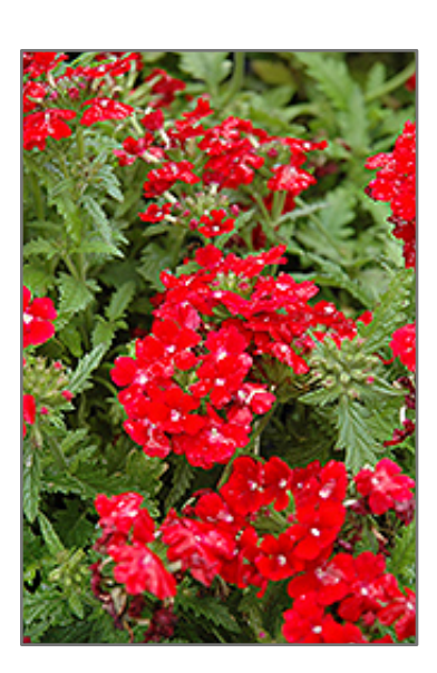
Obsession Red Verbena flowers

Obsession Red Verbena features showy clusters of red star-shaped flowers at the ends of the stems from late spring to mid fall. The flowers are excellent for cutting. Its tiny tomentose narrow leaves remain green in colour throughout the season.