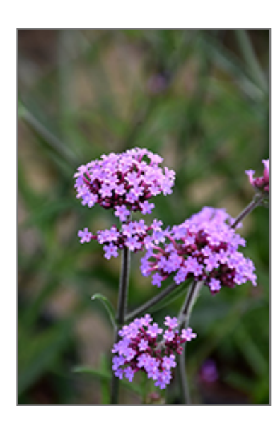
Lollipop Verbena flowers

Lollipop Verbena features airy clusters of purple flowers with pink overtones at the ends of the stems from early summer to late fall, which emerge from distinctive fuchsia flower buds. The flowers are excellent for cutting. Its narrow leaves remain green in colour throughout the season.