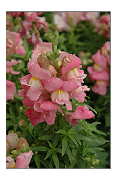
Snapshot Pink Snapdragon flowers

Bushy, compact plants with a mounded upright habit produce fragrant flower spikes in vibrant colors, rising above medium green foliage; excellent cool weather performance in garden beds, borders and containers; pretty in fresh-cut arrangements