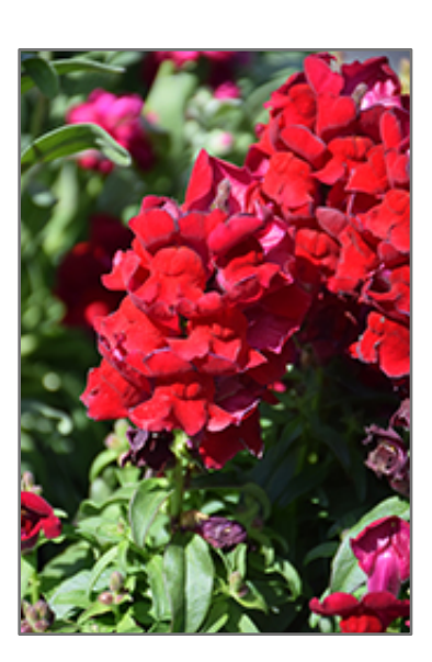
Snapshot Red Snapdragon flowers

Bushy, compact plants with a mounded upright habit produce fragrant flower spikes in vibrant colors that rise above medium green foliage; excellent cool weather performance in garden beds, borders and containers; pretty in fresh-cut arrangements