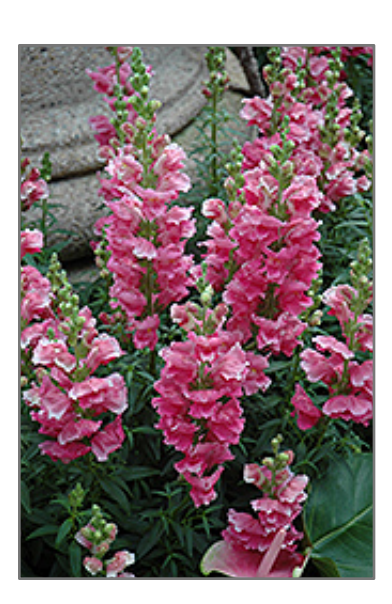
Liberty Classic Rose Pink Snapdragon flowers

Tall flower spikes are the focus on these well branched, easy to grow plants with little no maintenance required; rosy-pink blooms create a stunning impact when massed in the gardens, borders or patio containers; perfect for fresh-cut arrangements