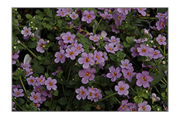
Abunda Colossal Blue Bacopa flowers

Hardiness Zone: (annual) Group/Class: Abunda Series