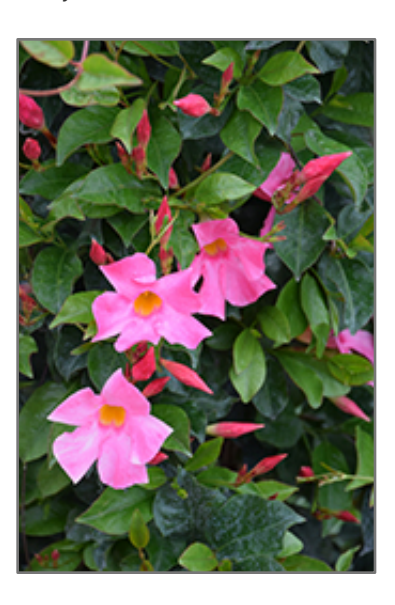
Sun Parasol Pretty Pink Mandevilla flowers