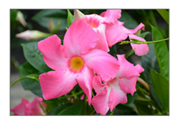
Sun Parasol Pretty Pink Mandevilla flowers

This plant is native to the tropics and prefers growing in moist environments with evenly warm conditions all year round. In our climate, it is usually grown as an outdoor annual in the garden or in a container. If you want it to survive the winter, it can be brought in to the house and provided with special care, and then returned to the garden the following season. In its preferred tropical habitat, it can grow to be around 10 feet tall at maturity, with a spread of 24 inches. However, when grown as an annual or when overwintered indoors, it can be expected to perform differently, and its exact height and spread will depend on many factors; you may wish to consult with our experts as to how it might perform in your specific application and growing conditions.