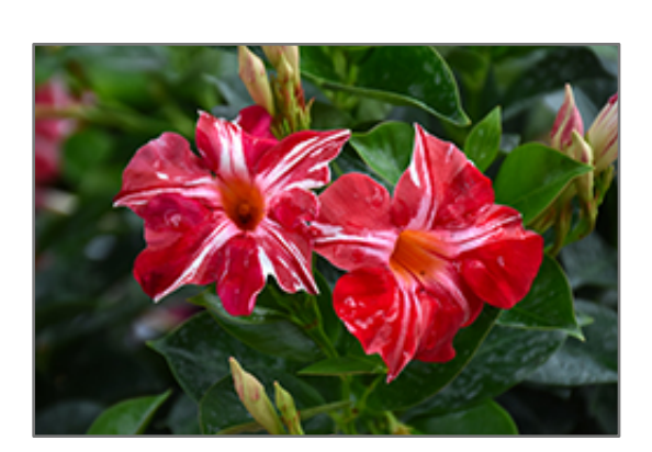
Sun Parasol Stars and Stripes Mandevilla flowers

Large, elegant blooms appear on this vigorous, twining vine from early summer until fall; deep green foliage serves as the perfect contrast; great for arbors, garden walls, containers or baskets