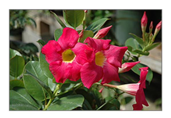
Red Riding Hood Mandevilla flowers

This plant does best in full sun to partial shade. It requires an evenly moist well-drained soil for optimal growth. It is not particular as to soil type or pH. It is highly tolerant of urban pollution and will even thrive in inner city environments. This is a selected variety of a species not originally from North America, and parts of it are known to be toxic to humans and animals, so care should be exercised in planting it around children and pets. It can be propagated by cuttings; however, as a cultivated variety, be aware that it may be subject to certain restrictions or prohibitions on propagation.