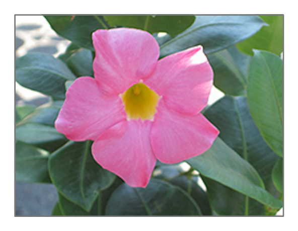
Red Riding Hood Mandevilla flowers