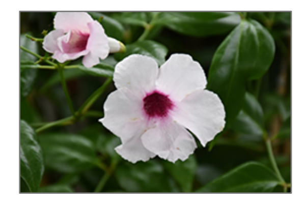
Pink Bower Vine flowers

Pink Bower Vine is a multi-stemmed annual with a ground-hugging habit of growth. Its medium texture blends into the garden, but can always be balanced by a couple of finer or coarser plants for an effective composition.