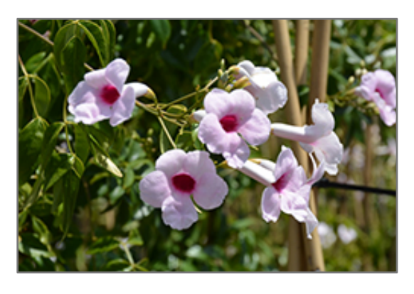
Pink Bower Vine flowers

This plant will require occasional maintenance and upkeep, and should only be pruned after flowering to avoid removing any of the current season's flowers. It is a good choice for attracting butterflies and hummingbirds to your yard. It has no significant negative characteristics.