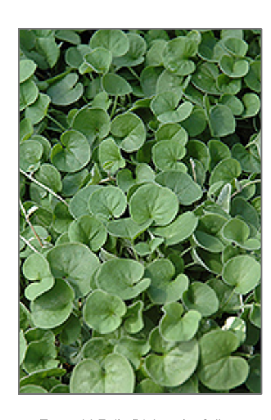
Emerald Falls Dichondra foliage