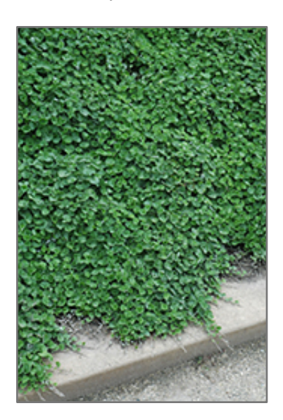
Emerald Falls Dichondra