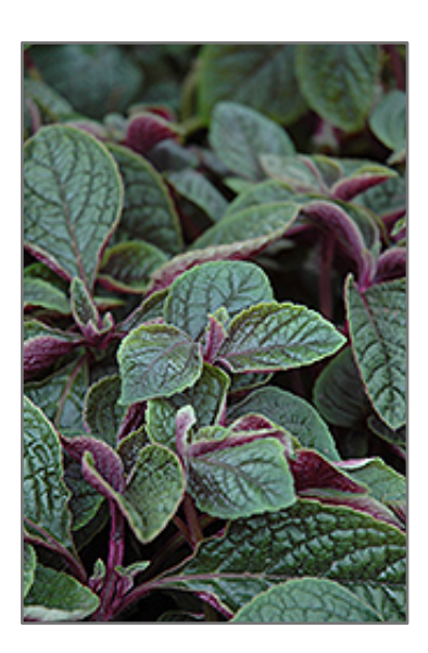
Nico Swedish Ivy foliage

Nico Swedish Ivy's attractive textured oval leaves remain dark green in colour with curious purple undersides throughout the season on a plant with a spreading habit of growth.