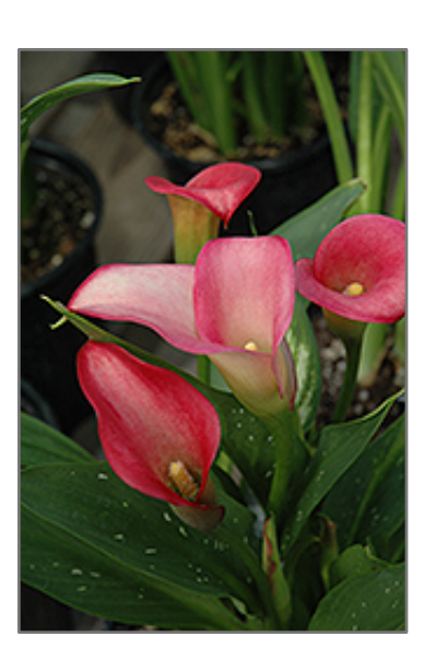
Fire Glow Calla Lily flowers

Fire Glow Calla Lily features bold tomato-orange trumpet-shaped flowers with orange overtones and yellow centers rising above the foliage from early summer to early fall. The flowers are excellent for cutting. Its attractive large glossy heart-shaped leaves remain dark green in colour with distinctive white spots throughout the season.