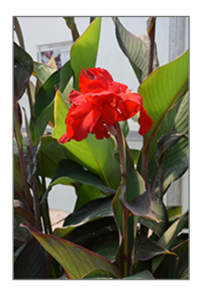
Black Knight Canna flowers

This plant should only be grown in full sunlight. It prefers to grow in moist to wet soil, and will even tolerate some standing water. It is not particular as to soil type or pH. It is highly tolerant of urban pollution and will even thrive in inner city environments. Consider applying a thick mulch around the root zone in winter to protect it in exposed locations or colder microclimates. This particular variety is an interspecific hybrid. It can be propagated by division; however, as a cultivated variety, be aware that it may be subject to certain restrictions or prohibitions on propagation.