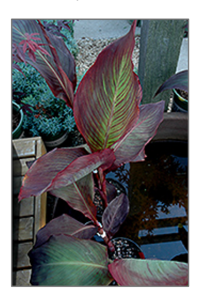
Black Knight Canna foliage