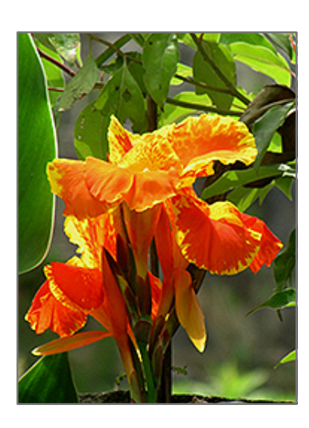
Color Clown Canna flowers

This plant is native to the tropics and prefers growing in moist environments with evenly warm conditions all year round. In our climate, it is usually grown as an outdoor annual in the garden or in a container. If you want it to survive the winter, it can be brought in to the house and provided with special care, and then returned to the garden the following season. In its preferred tropical habitat, it can grow to be around 24 inches tall at maturity extending to 3 feet tall with the flowers, with a spread of 12 inches. However, when grown as an annual or when overwintered indoors, it can be expected to perform differently, and its exact height and spread will depend on many factors; you may wish to consult with our experts as to how it might perform in your specific application and growing conditions.