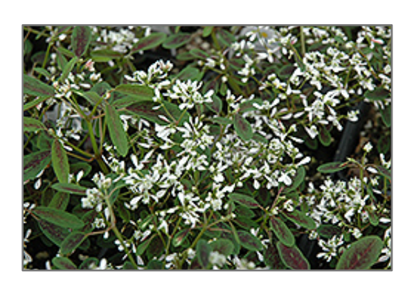
Breathless Blush Euphorbia flowers

From shade to sun, this mounded variety shows off small and airy white and pink flowers, contrasting against deep green foliage with red variegation; excellent for containers, borders and beds; easy to grow and low maintenance