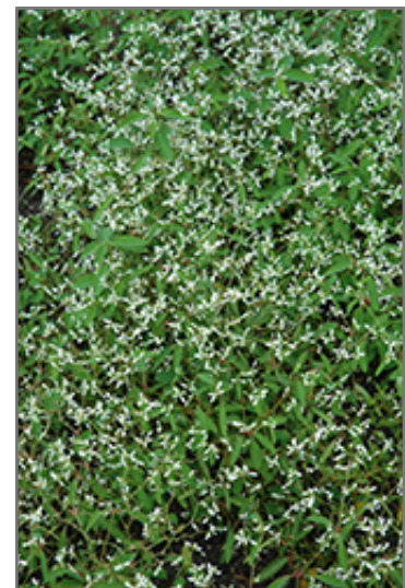
Breathless White Euphorbia flowers