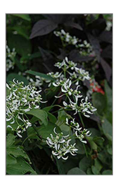
Euphoric&tade; White Euphorbia flowers