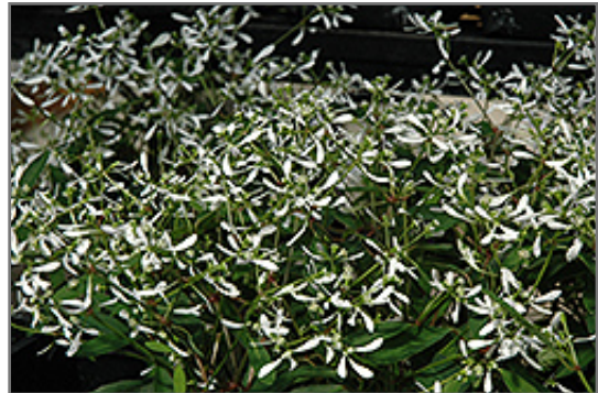
Silver Fog Euphorbia flowers