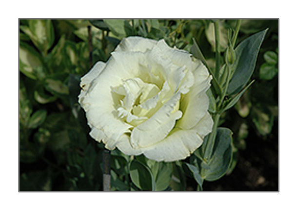
Cinderella White Lisianthus flowers

A lovely variety producing elegant, cup shaped, bright white flowers; pinch young plants to encourage branching; great for containers or garden beds