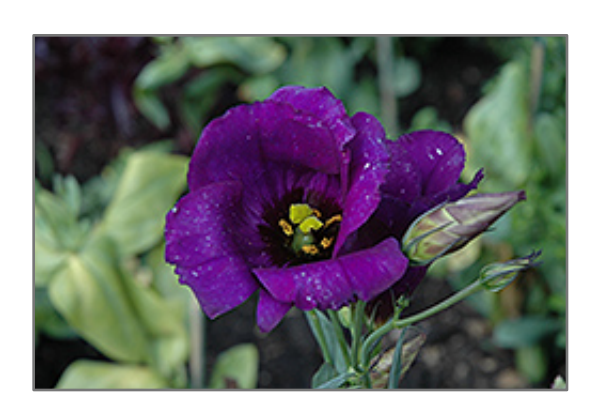
Laguna Purple Lisianthus flowers

Beautiful deep purple cup-shaped flowers stand above green foliage on upright and fast growing plants; great for borders, beds and containers; excellent when used in fresh-cut arrangements; remove spent flowers to encourage new growth