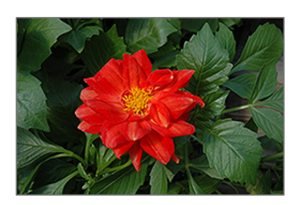
Figaro Red Dahlia flowers

This lovely dwarf variety is a prolific bloomer, producing masses of velvety red flowers for a long period, beginning in mid summer; wonderful along borders or in containers; not frost hardy