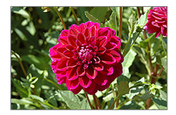
Boogie Nights Dahlia flowers