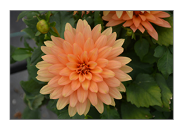
XXL Hidalgo Dahlia flowers

A beautiful, compact selection producing large peachy-orange double blooms, sitting above medium green, toothed foliage; vigorous and strong branching with great re-blooming qualities, perfect for the garden or patio containers