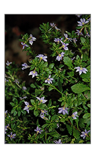
Cajun Blue Fan Flower flowers

Cajun Blue Fan Flower is an herbaceous annual with a trailing habit of growth, eventually spilling over the edges of hanging baskets and containers. Its relatively fine texture sets it apart from other garden plants with less refined foliage.