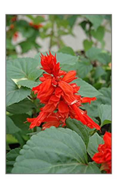
Salvador Red Salvia flowers

Salvador Red Salvia has masses of beautiful spikes of red flowers rising above the foliage from early summer to mid fall, which are most effective when planted in groupings. The flowers are excellent for cutting. Its fragrant narrow leaves remain green in colour throughout the season.